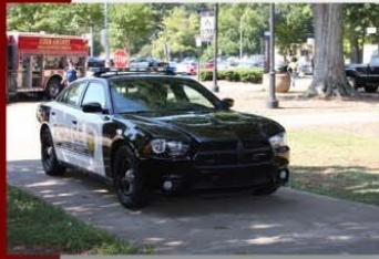
Cobb County Police participated!