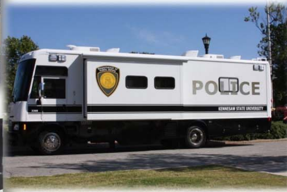
Students had the opportunity to tour the Mobile Command Vehicle.